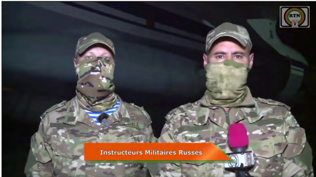
Arrival of the AC “instructors” into Niger in April 2024.