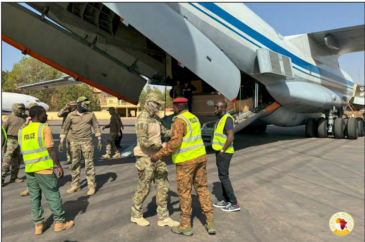
Arrival of the AC contingent into Burkina Faso in January 2024

competent contingent of around 100 Russian fighters on 24 January 2024 (with another 200 to be announced). According to a text on the African Initiative Telegram, which was the first (before the official AC channel) to publish photos of the offloading, the mission is primarily to protect the Ouagadougou-Bamako road threatened by extremists and “French-backed” bandits. 50 It is also intended to help ensure the security of Col. Traore, which replicates the model previously used by WG in CAR under the banner of the Sewa Security Services. However, it can be assumed that they will, as in Mali, take part in supporting the army on the frontline. The Loubila installation near Ouagadougou is considered to be the first African AC base. Following the logic of “replacing” WG with AC, one would expect that in a country with no previous history of a WG force presence, only the AC network would be built, serving as a “display window” for the new structure. This is also suggested by the opening of the Russian embassy and a Russian House in the Burkina Faso capital in December 2023. 51 Nevertheless, in the recruitment channels of the “old” WG, again looking for volunteers for African missions, there have been suggestions that the Wagner operators are planning a presence in this country as well. 52 If this were to happen, it would confirm the trend of combining the capabilities of the two structures rather than the consistent elimination of WG in favour of AC.