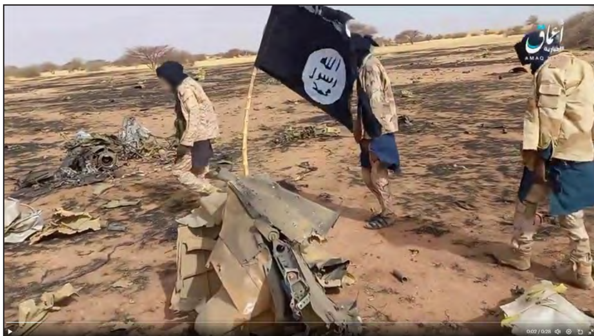
IS militants investigating a Malian aircraft crushed on April 29, allegedly piloted by Russians