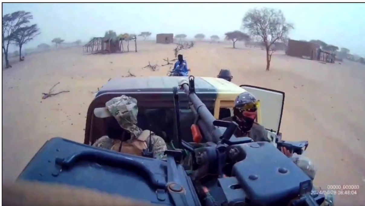
AC patrolling Mali-Mauritania border in April 2024